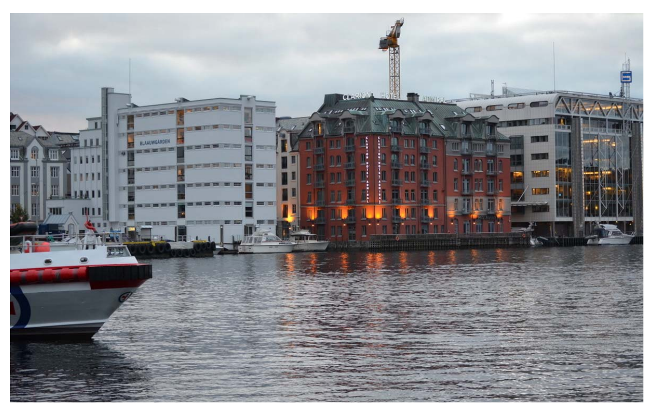
Bergen, Norway