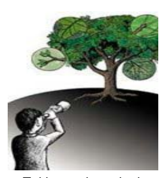
Taking a closer look

When we published our first Volume X study, we found that the worldwide flowmeter market equaled US$3.1 billion in 2002. It has continued to grow from this time until today. In order to make this market more understandable, we divide it into three flowmeter groups: New-Technology, Traditional Technology, and Emerging Technology. From there, we look at each of the flowmeter technologies individually. Then we build up the total market from the individual flowmeter types. This technique gives you a comprehensive view of the parts and the whole.