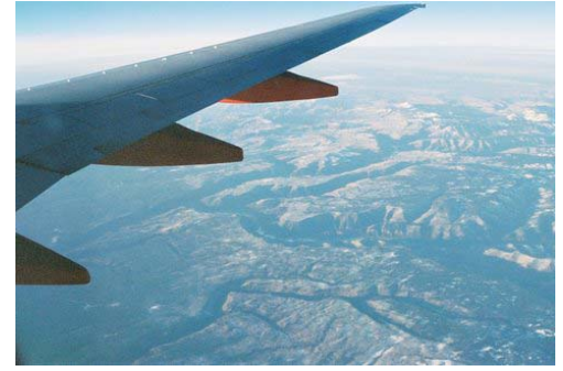
The view from 20,000 feet

Now you can profit from comprehensive market research on the worldwide flowmeter market – all in one place. The World Market for Flowmeters, 7<sup>th</sup> Edition, is now available. It presents a complete picture of the worldwide flowmeter market. This study includes both new-technology and traditional technology flowmeters, as well as the emerging flow technologies of sonar and optical.