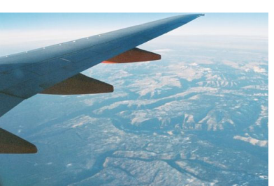
The view from 20,000 feet

The main goals of this study are to determine the size of the worldwide flowmeter market, including all technologies, assess effects of the pandemic and signs of recovery, and to see if the trend towards new-technology flowmeters continues. This study contains revenue, unit, and average selling price data for all flow technologies, segmented by region. It provides the tools you need to compare market size, market shares, and growth rates for all the flow technologies. It also provides product analysis and growth factors for each flowmeter type. Volume X enables you to assess your competitive position in the flowmeter markets you supply and the markets you compete against. Market forecasts through 2024 are included.