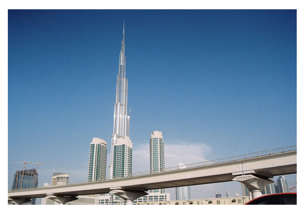
Burj Khalifa, Dubai, United Arab Emirates