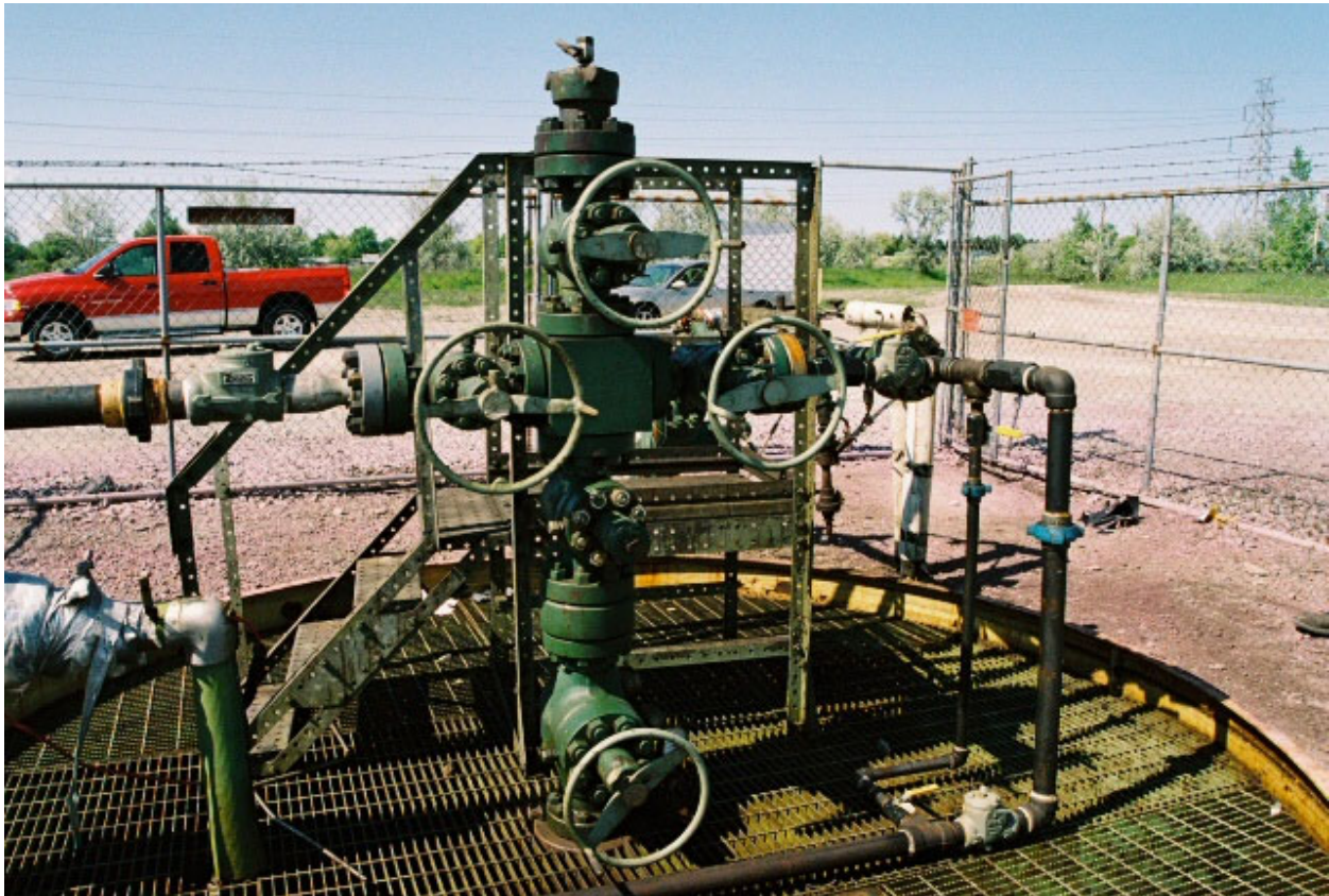
A Christmas Tree on an Oil Well near Traverse City, Michigan.

Flow Research, Inc. 27 Water Street Wakefield, MA 01880, USA +1 781-245-3200 +1 781-224-7552 (fax) www.flowresearch.com