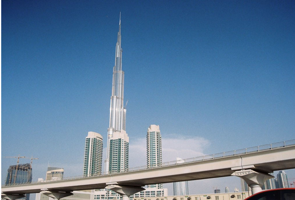
Burj Khalifa, Dubai, United Arab Emirates