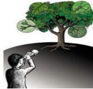
Taking a closer look

When we published our first Volume X study, we found that the worldwide flowmeter market equaled US$3.1 billion in 2002. It has continued to grow from this time. In order to make this market more understandable, we divide it into three flowmeter groups: New-Technology, Conventional, and Emerging Technology. From there, we look at each of the flowmeter technologies individually. Then we build up the total market from the individual flowmeter types. This technique gives you a comprehensive view of the parts and the whole.